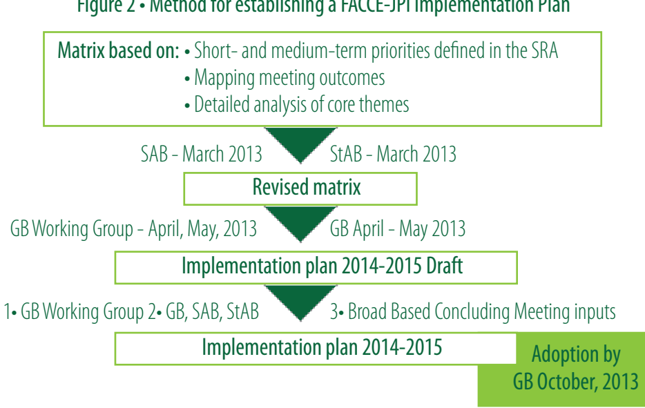
Figure 2 • Method for establishing a FACCE-JPI Implementation Plan

This meeting also considered some of the cross-cutting issues to be addressed when designing research actions (Annex). To put in place new actions, the GB may establish a working group, including representatives of the SAB and StAB, to define the scope of the action and the means for carrying it out.